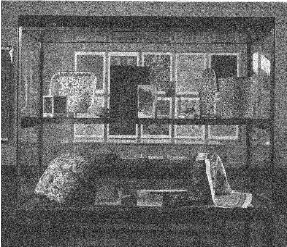
Fig. 3. A selection of contemporary ‘heritage’ products from the 1990s and early 2000s using designs by William Morris, as displayed in Mabb’s exhibition.

examples of ‘Morris kitsch’ in a cabinet as part of the show [Fig. 3]. Protecting these commodities behind glass implies a value that is absent when the same objects appear on a shelf next to a Jarrow March jigsaw or a William Blake coaster. Mabb thus abuses the techniques of cultural legitimisation in order to insert the ‘kitschification’ of Morris into a context of institutional critique.