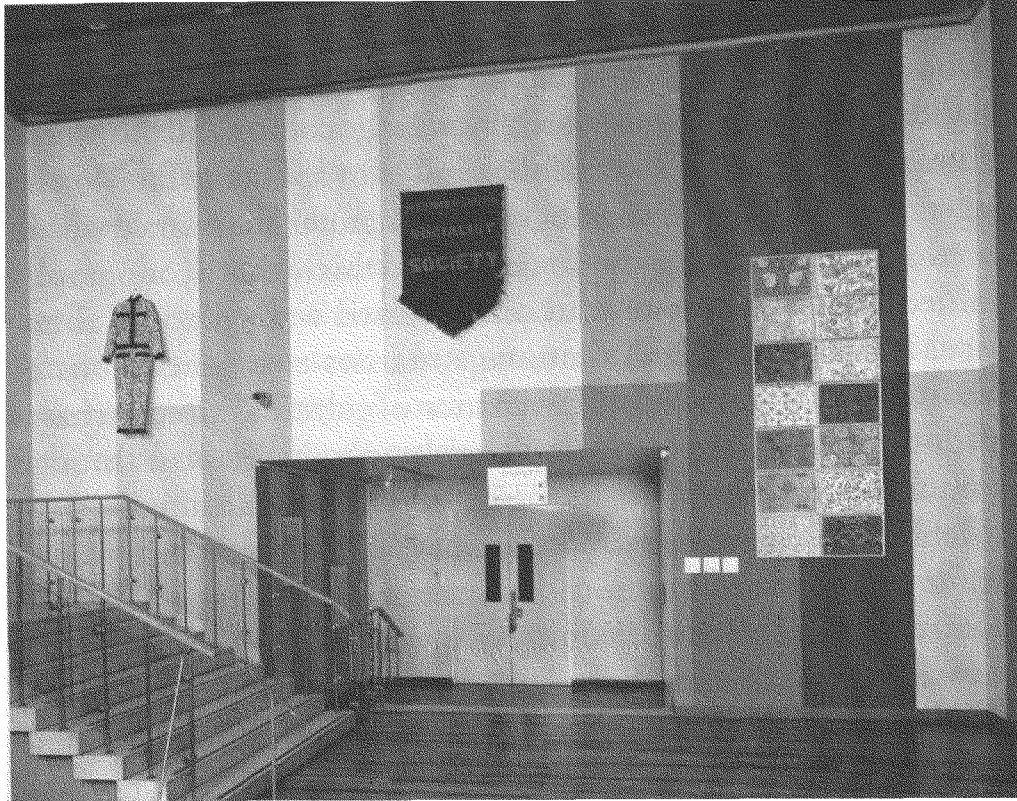
Fig. 1. Rodchenko Production Suit, Hammersmith Socialist Society banner and framed wallpaper samples produced before 1917, all hung against William Morris paint colours manufactured for Arthur Sanderson & Sons Ltd. by The Little Greene Paint Company. Whitworth Art Gallery, Manchester, April – December 2004.